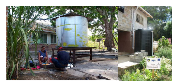
Rainwater harvesting such as on Banaba, Kiribati (I) and Mabouya Valley, Saint Lucia (r) has been under utilised in many small island countries.