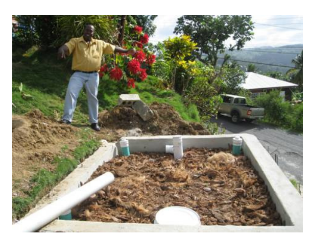
Accessible technology solutions, such as this wetlands filtration system, are being constructed in Saint Lucia as part of an overall approach to managing wastewater in a changing climate.

Unless something is done soon, the severe water problems across both the Pacific and Caribbean regions will considerably worsen under the influence of climate change. This message was conveyed by several Pacific leaders attending the 1st Asia Pacific