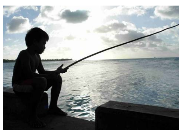
Many islanders rely on coastal resources.