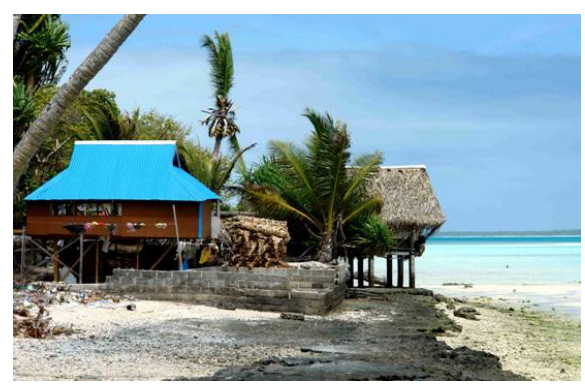
Water resources on atoll islands like South Tarawa in Kiribati are being affected by climate variability and change.

The Carib-HYCOS project seeks to enhance natural disaster mitigation capabilities by the use of modern flood forecasting and warning systems; strengthen water management capabilities by improving the knowledge base of water resources concerning quantity, quality and use; increase exchange of information and experience, particularly during natural disasters; and develop technological capabilities (including training and technology transfer) appropriate to the circumstances and realities of each country. It is expected that the project implementation will result in: (a) better understanding of the regional hydrological phenomena and trends in order to rationalize the use of water resources; (b) modernization of the region's water