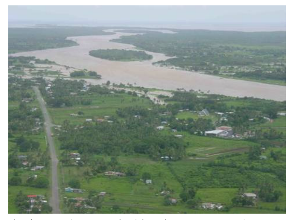
Flooding in Fiji's Rewa Delta.

Increasingly variable rainfall, cyclones / hurricanes, accelerating storm water runoff, floods, droughts, decreasing water quality and increasing demand for water are so significant in many small island countries that they threaten the economic development and the health of their peoples.