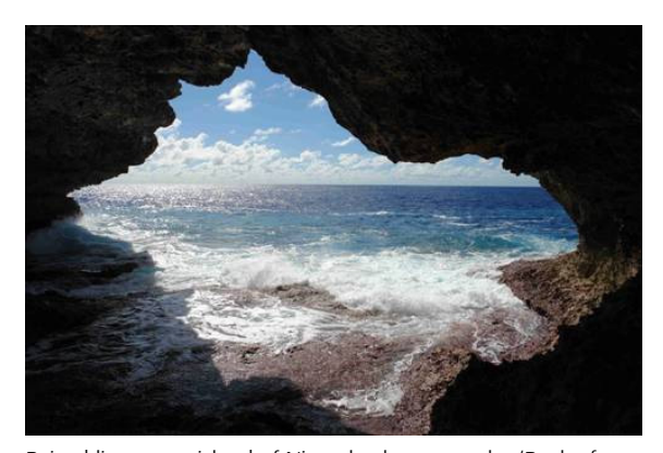
Raised limestone island of Niue also known as the 'Rock of Polynesia'.

Regarding the vulnerability of small island countries and territories to climate variability and change as well as anthropogenic influences, the required coping and adaptation strategies have been articulated under a specific theme of 'Island Vulnerability' in the Pacific Regional Action Plan on Sustainable Water Management (SOPAC, 2002) as follows: