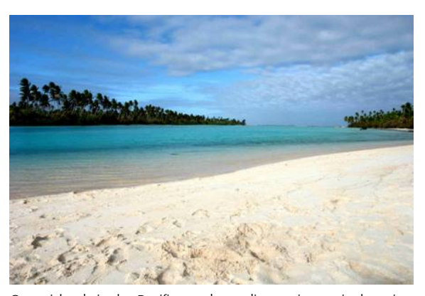
Outer islands in the Pacific are depending on increasingly variable rainfall

Through the analyses of rainfall data and use of GIS in Tuvalu, under the Pacific HYCOS programme, support is provided to an AusAID and EU-funded initiative, Vulnerability and Adaptation, to provide all households on the main atoll of Funafuti with a rainwater harvesting tank in order to provide a strategic water storage to overcome extended periods of droughts which are often linked to ENSO episodes. The UNEP, through CEHI, is supporting similar efforts in Caribbean SIDS by using GIS-assisted mapping methods of rainfall capture potential and water availability to promote the practice of rainwater harvesting in water stressed parts of the region.