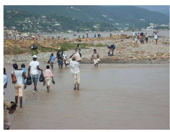
Jamaicans crossing the Hope River following flooding from Hurricane Gustav.