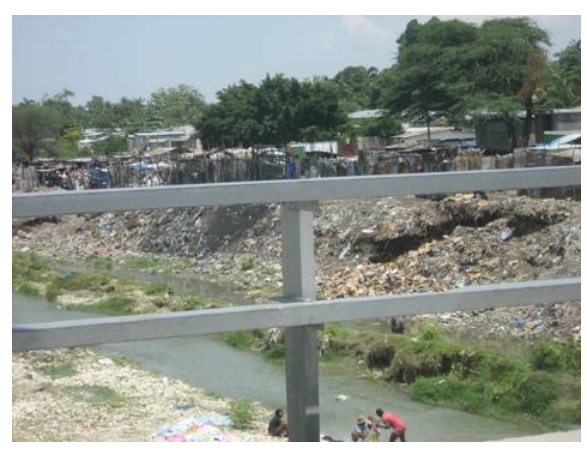
Poor, unregulated settlements on the river's edge in Haiti are highly prone to flooding.