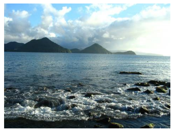
View from Pigeon Island in Saint Lucia (Donna Spencer).

CEHI in turn is coordinating the Caribbean's position at the 5<sup>th</sup> World Water Forum through the Americas Regional Process leading to the 5<sup>th</sup> World Water Forum, with the formulation of a position paper prepared with support from the Inter-American Development Bank (IADB) and the World Bank. Additionally, CEHI continues to strengthen its mandate of integrating watershed and coastal areas management (IWCAM) in the Caribbean region under its programme portfolio and, as such, has undertaken many related activities.