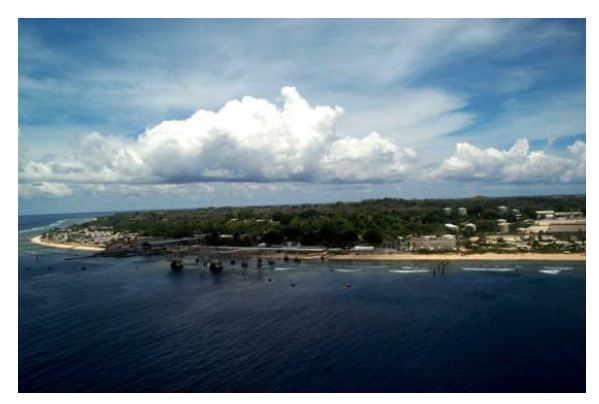
Raised limestone island of Nauru which is depending on rainwater harvesting and desalination.

At the 3<sup>rd</sup> World Water Forum global SIDS agreed to six priority actions, referred to as the Small Island Countries Portfolio of Water Actions namely: