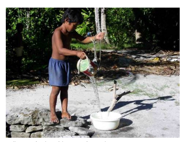
Pollution of vulnerable groundwater lenses are a major concern for many small island countries.

This requires close collaboration between the water supplier, the water quality and health regulator and the water resources managers in conjunction with a strong participation of communities living in catchments of high volcanic islands, on top of water