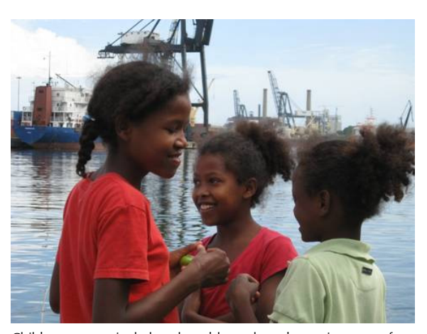
Children are particularly vulnerable to the adverse impacts of climate change, felt in the lower reaches of watersheds, such as the Haina Watershed in the Dominican Republic.

The introduction of DWSP is promoted in the Pacific through an AusAID-funded programme by SOPAC in collaboration with WHO, whereas the U.S. Centers for Disease Control and Prevention (CDC) is promoting this new concept together with CEHI in the Caribbean.