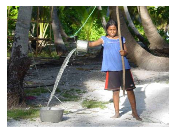
Improving access to water and sanitation requires political will

Climate change issues are addressed at the regional level by the Council for Trade and Economic (COTED) of the Caribbean Community (CARICOM). Additionally, Caribbean Heads of Government have included climate change as a specific item on the agenda of their meetings. Currently, the Prime Minister of Saint Lucia has the responsibility within the CARICOM Cabinet for climate change and sustainable development issues. At the last Caribbean