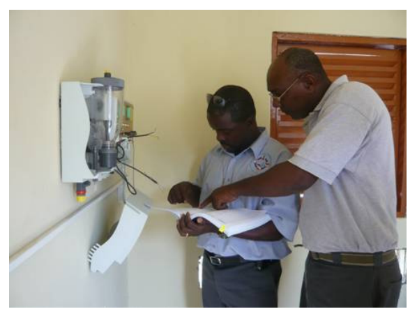
Water Utilities in SIDS, such as these technicians from St. Kitts, are working to address increasing demand and the challenges of climate change.